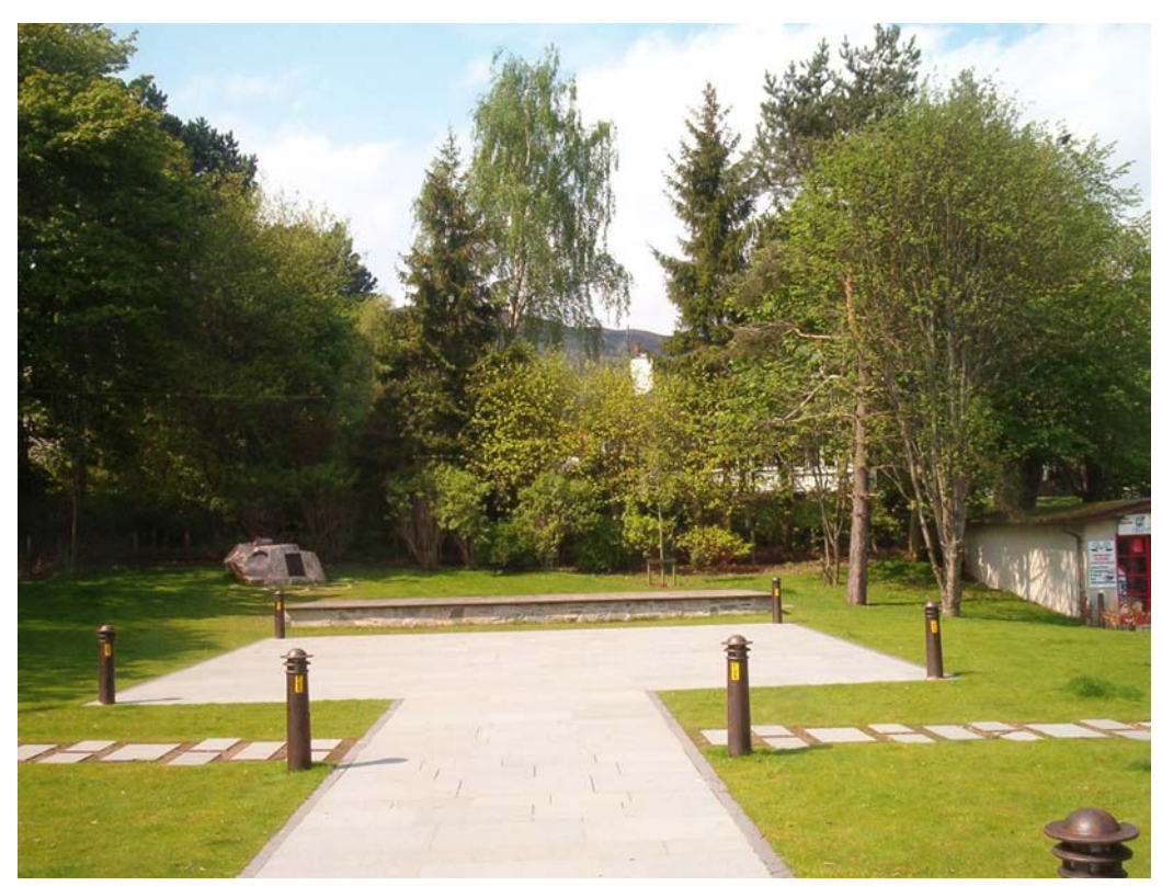
Fig 5 More recent photo showing changes to village green (Kila behind)