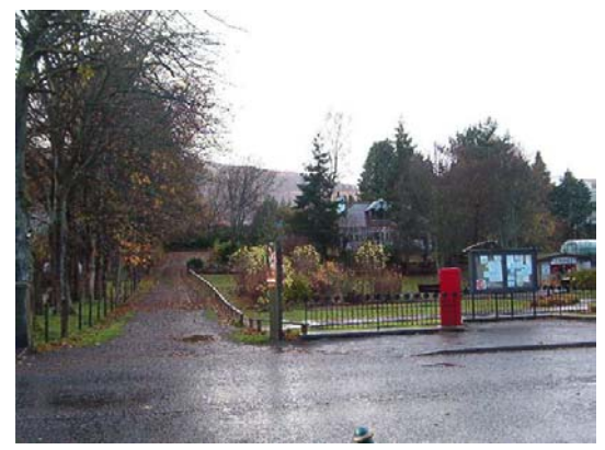
Fig 2 showing site access

1. The site for this application is a house known as 'Kila' to the rear of the village green on Grampian Road between the Cairngorm Hotel and a row of shops that join Tescos supermarket to the north. The site is located close (opposite) to the railway station. The site to be developed is partly screened from the village green by a line of trees.