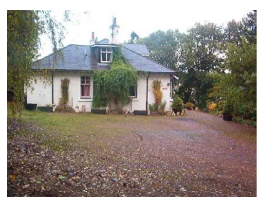
Fig 3 showing Kila (to be removed)