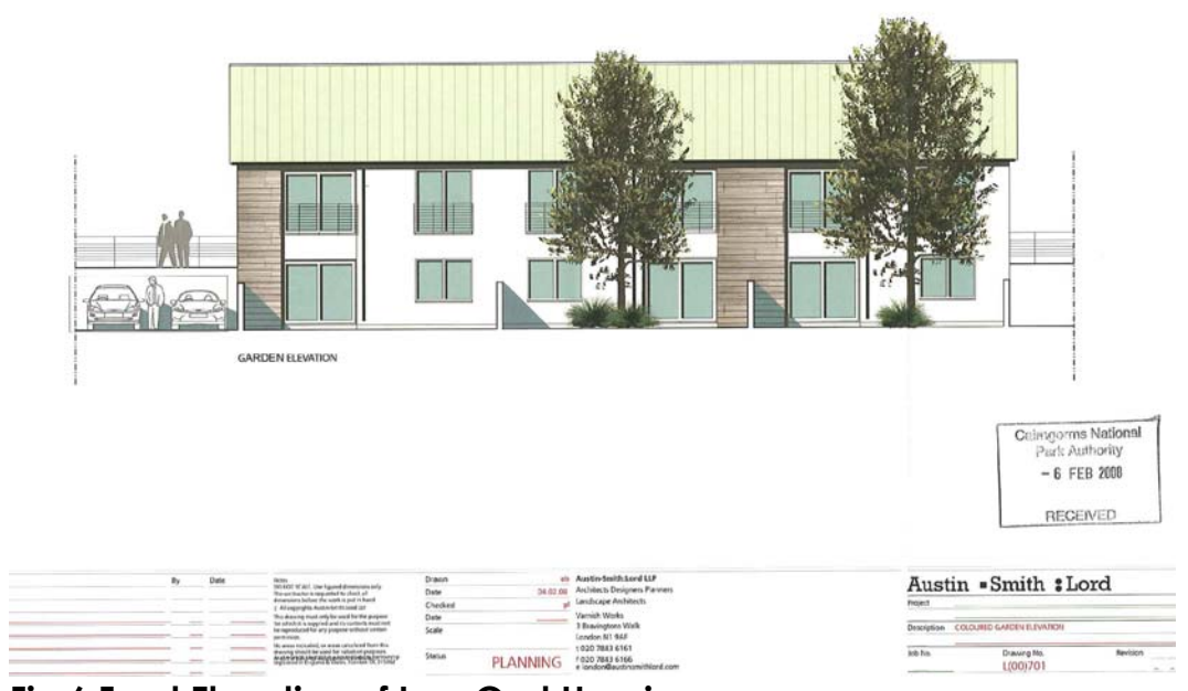
Fig 6 Front Elevation of Low Cost Housing

2. Kila is run by the existing occupant as a B & B. It is proposed that the house be demolished and replaced by 6 flats. Access would